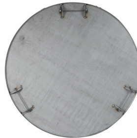
Safety Catch Pan

Scan this QR code to learn more details about this product.